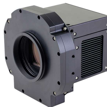
Shown with optional 65mm shutter housing