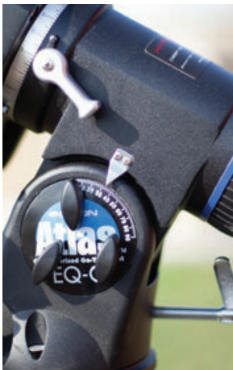
Image 4 –DSP's Latitude Adjustment Upgrade installs three large thumb bolts that firmly lock a pressure plate at the latitude hub.

havoc. Ed assured me that, while it likely wouldn't do much for my already-low periodic error, a HyperTune would certainly tame my guiding and backlash issues.