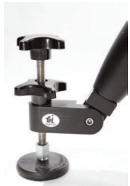
Image 5 – TPI tripod leg levelers allow fine adjustment of tripod level without having to lift a leg to extend it. Once fine adjustment is completed, the levelers lock rigidly.

The bottom line is that Deep Space Products will improve your astro-imaging experience. The HyperTune service, either