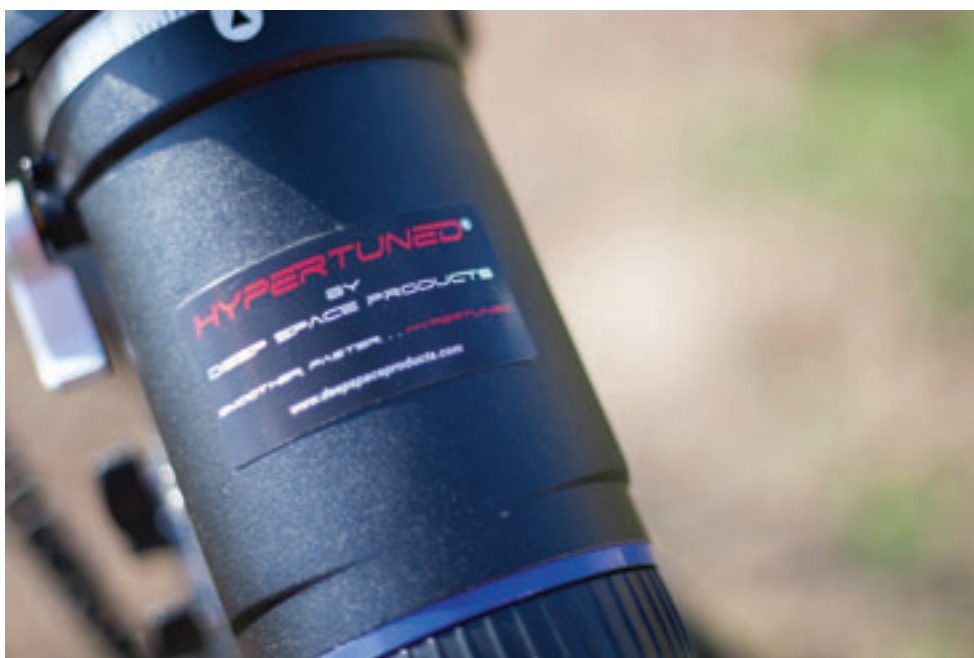
Image 3 – All mounts that receive the HyperTune service earn this distinctive plate.

sions on my mount, I had some questions before sending it off. One of the first issues I wanted to address was the tracking and guiding. My periodic error, right at 17-arcseconds peak to peak, was actually pretty