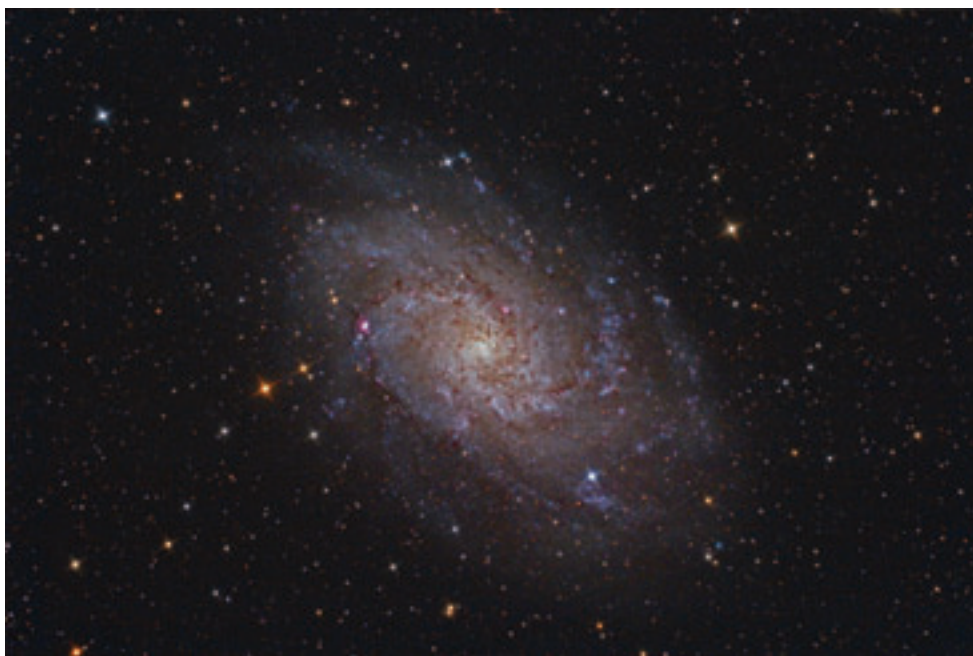
Image 2 – M33, composed of 54 x 300-second subs at ISO 800, calibrated with darks, flats and dark flats. Captured with BackyardEOS, shot with a Canon 60Da, an 8-inch f/4 Newtonian and the HyperTuned Atlas. Stacked and processed in Images Plus 5.0.

admirably, but I was never confident that I could just start an imaging session and walk away. In fact, it's become something of a