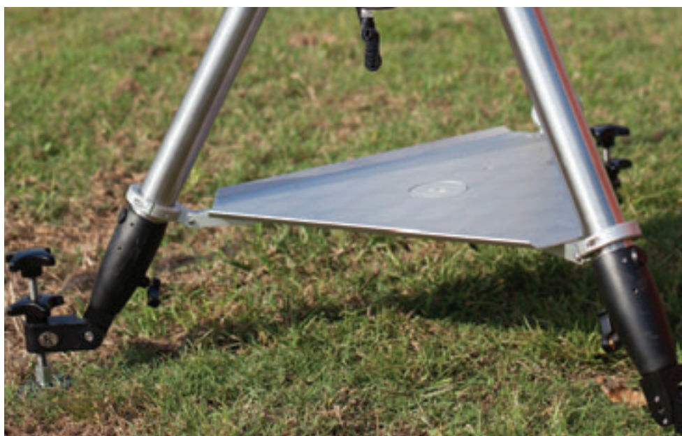
Image 6 – TPI’s unique spreader/tray assembly ensures absolute rigidity of the tripod by creating four large tensioned triangles. The tray is sturdy enough to support a full-sized field battery and is beautifully machined and finished.

sult, a spreader isn’t required to stop the legs from collapsing, but it can be used to exploit that “hard stop.” What the TPI