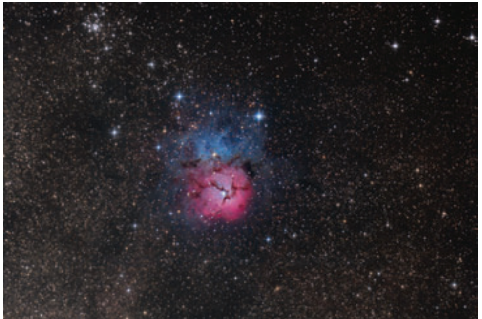
Image 1 – The Trifid Nebula, composed of 25 x 90-second subs at ISO 1600, calibrated with darks, flats and dark flats. Captured with BackyardEOS, shot with a HyperCams-modified full-spectrum Canon T2i with an Astronomik L Clip-In filter, an 8-inch f/4 Newtonian and the HyperTuned Atlas. Stacked and processed in Images Plus 5.0.

I’d be lying to you if I didn’t acknowledge that they, all of them, were right. I got great results, but it came at a cost. I spent a great deal of time tweaking my imaging rig. Polar alignment had to be nearly perfect.