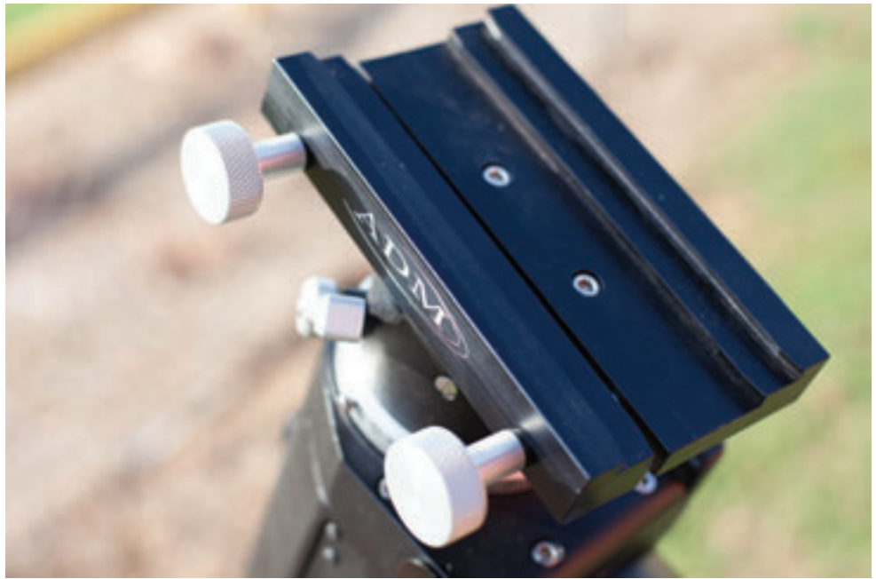
Image 5 – The ADM Dual Saddle upgrade allows use of either Vixen-style and Losmandy-format dovetail rails without marring the finish on either.

They got started by making improvements to the fork-mounts with which they were imaging. This evolved into several very helpful and well-read DIY projects, and it wasn't long before they moved on to GEMs. At this point, they have so many projects either in production or on the horizon, it won't be long before they get